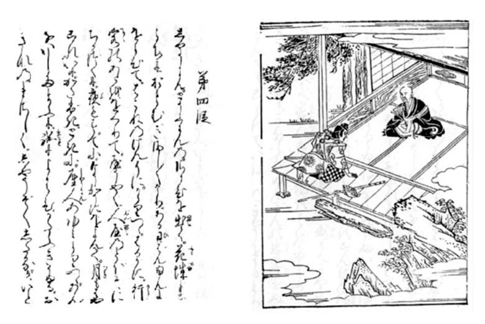
Fig. 3 - A scene that a mountain priest saw Shinran and believed devoutly in Buddhism

How illustrated books on Shinran came to be published can be summarized as follows. First, in Einin 3 (1295), Kakunyo's Honganji Shonin Shinran Den'e (the illustrated narrative scroll on the life of Shinran) was established. The main text, in verse, of this scroll was made into Godensho , while its illustrations were compiled into Goeden ; the latter was a hanging scroll and used for etoki . Illustrated books were published based on these two