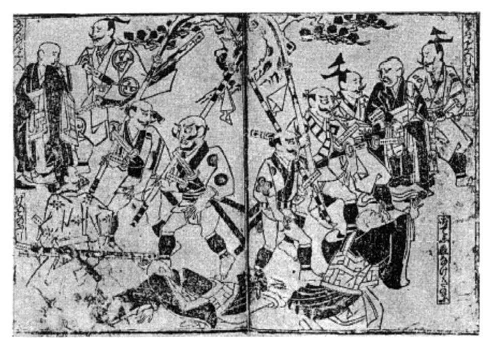
Fig. 4 - A scene of the separation of Honen and Shinran Story of Shinran, the edition of 1663 ([Hiramatsu] p.81)

types of compilations. For example, Shinran Shonin Godenki (Biography of Shinran) was published in Kanbun 12 (1672) and reprinted (Picture 3). The joruri<sup>5</sup> text Shinran Ki (Story of Shinran), which may be considered an illustrated Buddhist text in a wide sense, was performed as a puppet show in Osaka, but its performance was banned in response to the complaint made by Higashi Honganji Temple; its publication was also banned (Picture 4) ([Ogawa] [Kusaka] [Sakato]).